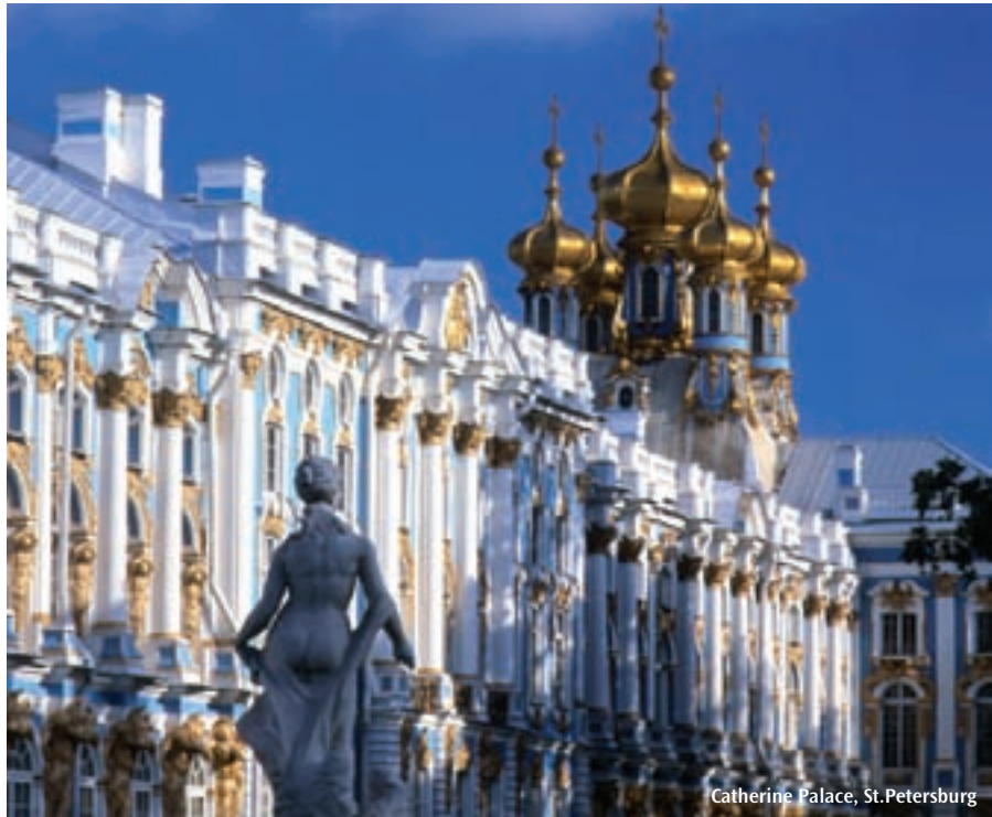
Catherine Palace, St. Petersburg